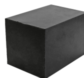
RM UG 实心/单径模块