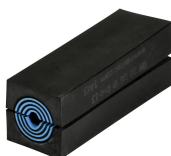
Multidiameter™ 多径 UG™ 模块